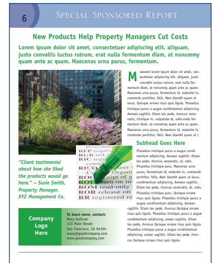
Example of a Sponsored Article (Advertorial)